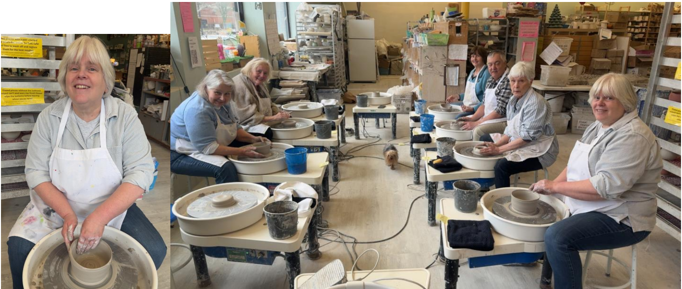
Seniors at Potter Class in Art Signals