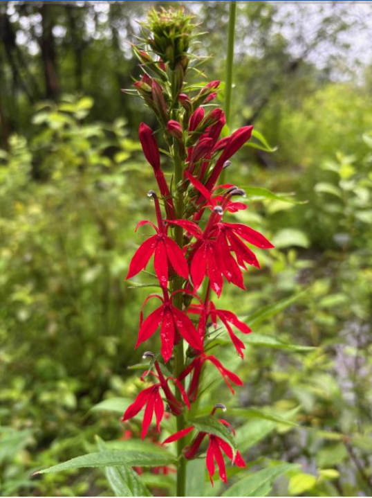
Ice Housing Landing, August 1, 2025