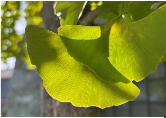
Ginkgo biloba tree on southeast wall of Maynard Library, September 2025.